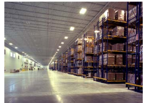
Diversey, Inc. Distribution Center, Sturtevant, WI LEED Gold certified