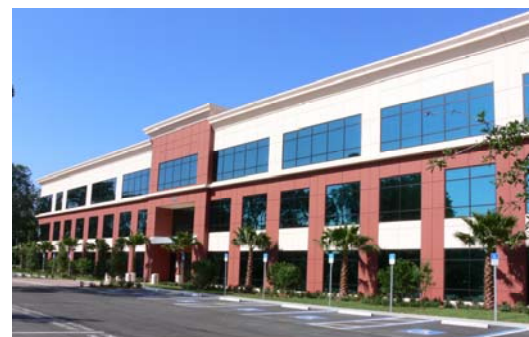
4631 Woodland Corporate Boulevard, Tampa, FL LEED Gold certified