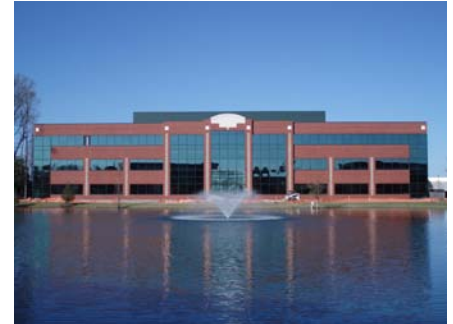
Liberty III, Chesapeake, VA LEED Silver certified

This 123,000 square foot 3-story office building, developed for The Vanguard Group, is the first LEED Gold certified commercial building in Scottsdale and utilizes photovoltaic cells to generate energy and incorporates abundant daylighting techniques.