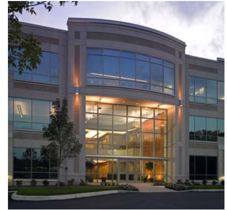
420 Delaware Avenue, Ft. Washington, PA LEED Silver certified

This build-to-suit for Tasty Baking Company provides production, warehousing and distribution in a 345,500 square foot, state-of-the-art bakery-warehousing facility designed to achieve LEED Silver certification.