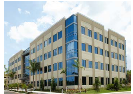
Boca Colonnade II, Boca Raton, FL LEED Gold certified

This 616,000 square foot, Class A bulk distribution facility is part of a 143-acre, 1.7 million square foot distribution center, Hunters Green II. It earned LEED Silver certification for its many green features which include native plantings that require no irrigation; high efficiency water conserving toilets, sinks and shower fixtures to reduce water consumption by over 30%; a construction waste management program diverting 75% of construction waste from landfills and choosing paints, sealants, coatings and carpeting that reduce the indoor air contaminants that are harmful to its occupants.