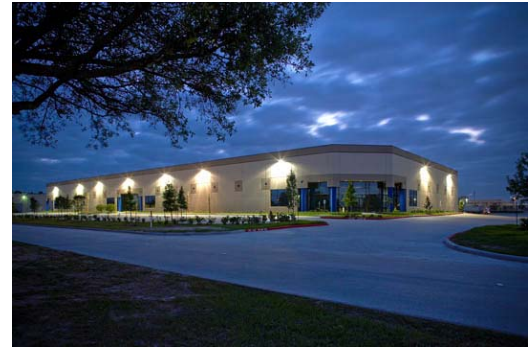
Central Green 9, Houston, TX LEED Silver certified

This 104,500 square foot Class A office building achieved LEED Gold certification by incorporating state-of-the-art technology to offer exceptional air quality and abundant natural light while limiting resource consumption and lowering operating costs.