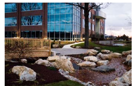
330 Fellowship Drive, Mt. Laurel, NJ LEED Gold certified