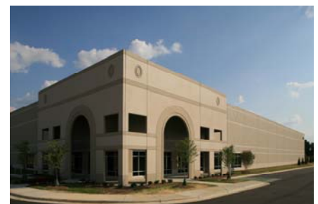
Bull Ridge Distribution Center, Greensboro, NC LEED Silver certified