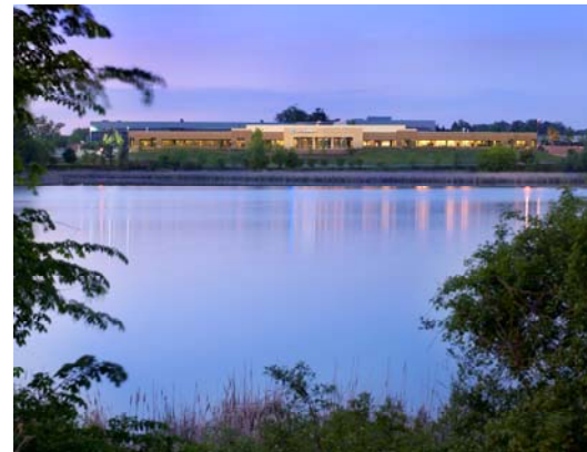
Lake Smetana, Eden Prairie, MN LEED Gold certified