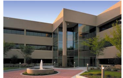
One Independence Point, Greenville, SC LEED –EB Certified

This new, 95,000 square foot office building earned LEED Gold certification and features light harvesting techniques such as a four-story, day-lit atrium and 10-foot ceilings on all floors for expansive daylight views. It is one of the few office buildings in Philadelphia to offer free parking as well as public transportation to Pennsylvania, New Jersey and Delaware.