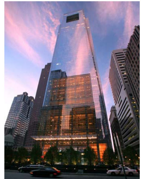
Comcast Center, Philadelphia, PA LEED Gold certified