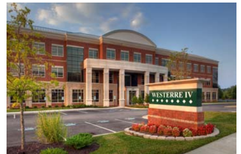
Westerre IV, Richmond, VA LEED Gold certified