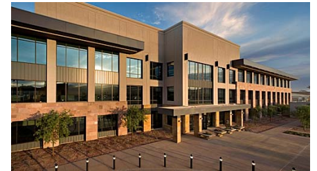
8501 East Raintree Drive, Scottsdale, AZ LEED Gold certified